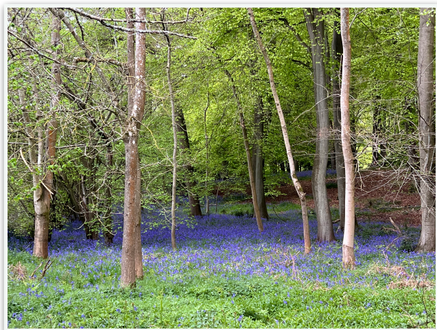
Welcome to spring. Bluebells at Henley on Thames.